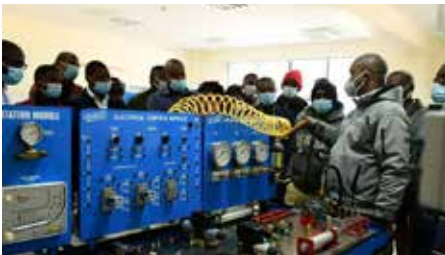
Mechatronics Engineering students conducting their practical lessons

the University has six schools, seven institutes and 24 centres. The University offers a wide range of programs both at the undergraduate and postgraduate levels. These include Computer Science and Information Technology, Engineering, Applied Sciences, Food Science and Technology, Health Science, Business Management and Economics, Geothermal Energy Technology, Geomatics, Geospatial Information Hospitality, Technical and Professional Studies.