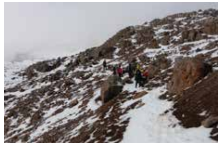
Climb to educate Students climbing Mt. Kenya

While in Nyeri you can visit the following for some of the outdoor activities mentioned above; Mount Kenya, Dedan Kimathi University wildlife conservancy, Tafari Castle and Game Lodge, Giraffe Ark, Treetops, Mount Kenya, Sangare Farm House-Mweiga Vilas, Aberdare National Park, Solio Ranch, Italian War Memorial Church, Lord Baden Powell Grave, Mau Mau Caves, Rhino watch sanctuary, Ol Pejeta conservancy and many more can be found online.