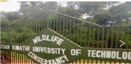
DeKUT Wildlife Conservancy