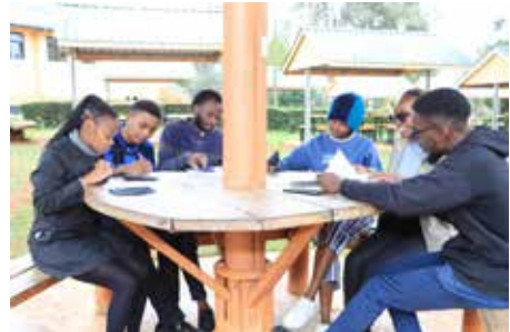
Serene Learning Environment

to contribute to the attainment of national development goals. DeKUT has two campuses: the Main Campus that is located 6 km from Nyeri town along Nyeri- Mweiga Road and Nairobi Campus located at Pension Towers, Loita Street.