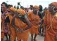
A group of Kikuyu women performing a traditional dance

In order to adjust to the new culture you need to: Understand that your reactions are normal, be open- minded and curious about your new environment, make friends with the local students and also other international students, if you struggle with academics, talk with your professors and advisors, try a new activities that you can't do in your home country, Don't forget the reasons you came to Kenya.