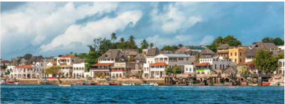
Flamingoes Zebras and Wildebeest at lake Nakuru

Lamu is a place like no other, a peaceful tropical island where life is lived at its relaxed rhythm, but a place whose history is as mysterious and fascinating as the winding streets of its medieval stone town. Lamu old town is a UNESCO World Heritage Site.