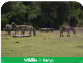
Wildlife in Kenya

The country has a population of more than 47 million people, with about five million residing in her capital city, Nairobi. There are at least 42 ethnic groups with each group having its unique language and culture. Kenya is also home to immigrants of other nationalities, including Europeans, Asians, Arabs and Somalis. Kenya's official languages are English and Swahili.