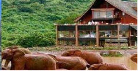
Aberdare Country Club