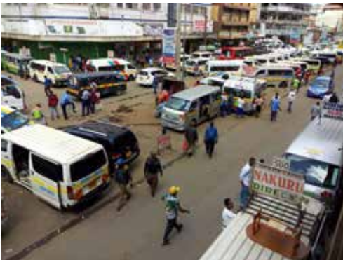
Matatus in a terminus

The commonly used modes of transport are: