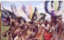
A group of Luos performing a traditional dance