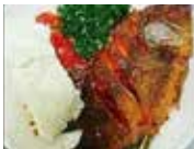
Ugali and Tilapia