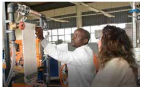
International Exchange Students during their internships