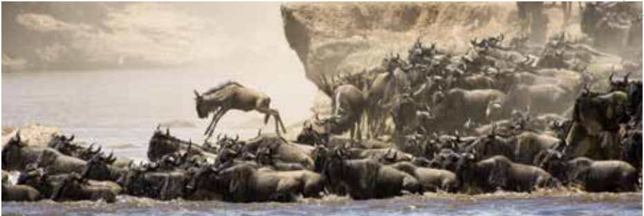
Wildebeest at the Mara

Simply known as The Mara. The Mara is a large national game reserve in Narok, Kenya, contiguous with the Serengeti National Park in Tanzania. It is named in honor of the Maasai people, the ancestral inhabitants of the area. Maasai Mara is one of the most famous and important wildlife conservation and wilderness areas in Africa, world-renowned for its exceptional populations of lion, African leopard, cheetah and African bush elephant. It hosts the Great Migration, which secured it as one of the Seven Natural Wonders of Africa, and one of the Ten Wonders of the World.