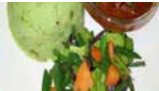
mukimo and beef stew