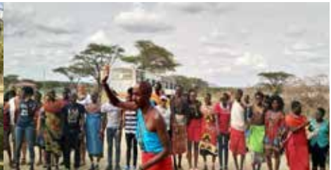
International Students visit to samburu National Park