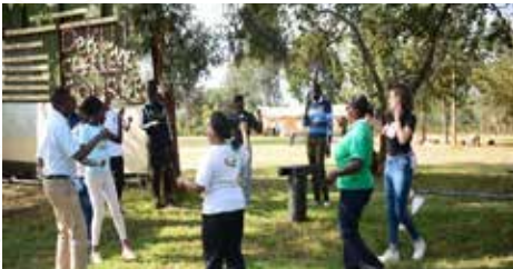
International Students during a coffee hour session

When culture shock hits you, just remember that it is a normal part of being an international student. The University through the International Office organizes cultural events and awareness forums for international students to help international students integrate and assimilate into the local culture easily.