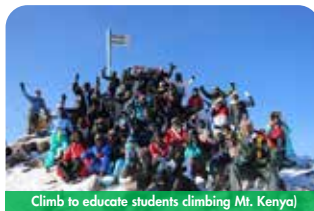
Climb to educate students climbing Mt. Kenya