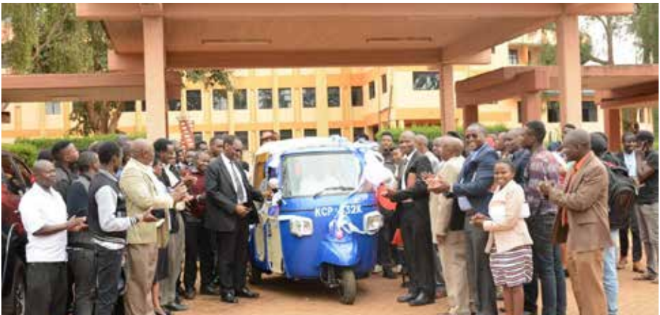
Launch of the TukTuk

Dedan Kimathi University of Technology (DeKUT) is committed to ensuring that all our students and staff are treated equitably. Since its inception, the University has been committed to understanding and applying the Social Model of Disability, thereby not focusing on an individual's medical condition or impairment, but instead identifying the impact of disability that prohibits disabled people from achieving equality and inclusion of their needs. DeKUT developed and promulgated the 1st Disability Mainstreaming Policy in 2010 and later revised it in 2017. The University has made appropriate adjustments to all its physical structures, practices, and environments to ensure that PWDs (students, employees or visitors) can participate equally and without exclusion in the workplace, training rooms, and other social and sporting facilities. Part of the efforts to realize this vision was developing a transport system (TukTuk) within the University that takes care of students and staff living with disabilities.