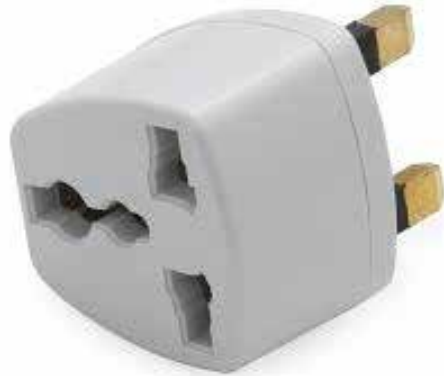
Type G adapter

Electricity in Kenya is between 220 and 240 volts, alternating at 50 cycles per second. If you travel to Kenya with a device that does not accept 240 Volts at 50 Hertz, you will need a voltage converter and an adapter that fits the plug sockets in Kenya. Electrical sockets (outlets) in Kenya are the “Type G” British BS-1363 type. If your appliance’s plug doesn’t match the shape of these sockets, you will need a travel plug adapter to plugin. Travel plug adapters simply change the shape of your appliance’s plug to match whatever type of socket you need to plug into.