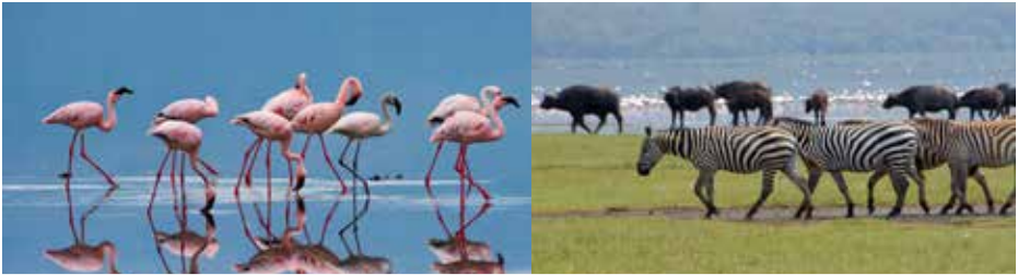
Flamingoes Zebras and Wildebeest at lake Nakuru

Nakuru is known for the thousands of Flamingoes, it provides the visitors with one of Kenyan best images, joined into a massive flock. Lake Nakuru National Park is home to rhinos, giraffes, lions and leopards. Lake Nakuru is an algae-filled soda lake that attracts thousands of flamingos. Lookout points such as Baboon Cliff and Lion Hills offer views of the birds, the lake and mammals including warthogs and baboons. Nakuru is a breathtaking site and it has become world-famous for flamingoes.