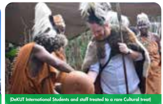
DeKUT International Students and staff treated to a rare Cultural treat

For more information about Kenya visit: https://magickalkenya.com/