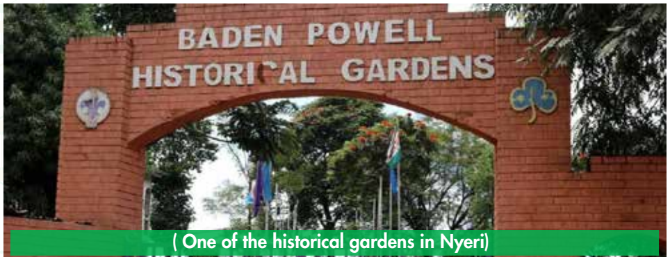
( One of the historical gardens in Nyeri)

Nyeri town's central business district is relatively small as compared to other cities in, for instance, Mombasa and Kisumu. While small business activities are vibrant, Nyeri is essentially a government administration city. The town has a relatively low cost of living in comparison to Nairobi and other major urban centers in Kenya.